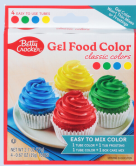
red & blue food coloring