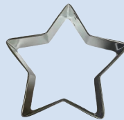
cookie cutter shapes