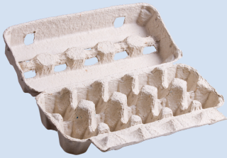
cardboard egg carton