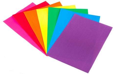
colored printer paper