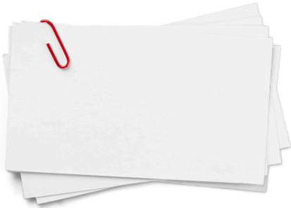
white printer paper