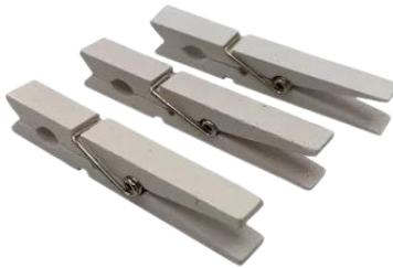
large white clothespins