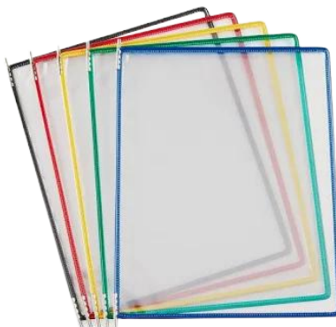
optional - page protector or reusable dry erase pocket