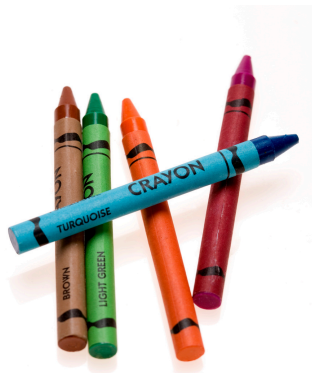
crayons, colored pencils, or markers