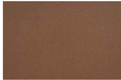
brown construction paper